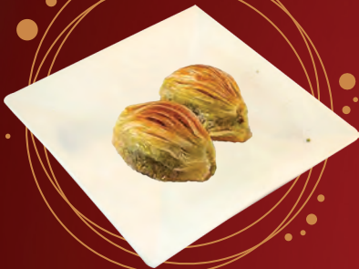
$8.99 82 Midye Baklava (2 pcs)