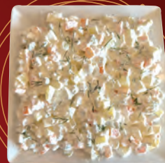
012-American Salad $9.99 Potatoes, Carrot, Green Peas, Fresh Dill, Mayonnaise, Salt & Black Paper