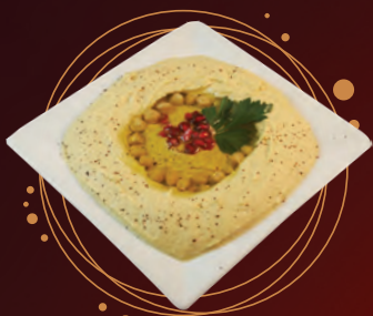
007-Humus $9.99 Mashed chickpeas & tahini seasoned with garlic