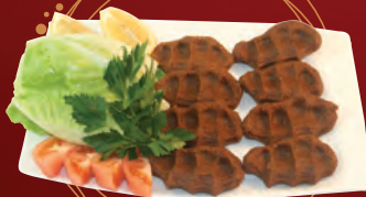
017-Cig Kofte 8 Pcs $9.99 Bulgur, Olive Oil, Limon, pomegranate Sauce, Seasonings.