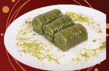
$9.99 84 Pistachio Roll (3 pcs)