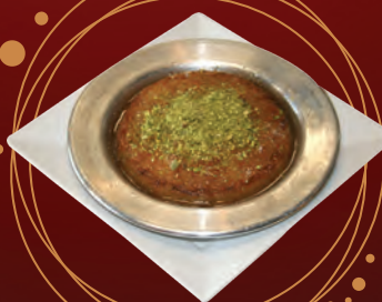
$9.99 89 Kunefe