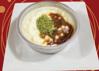
$7.99 86 Sutlac Rice Pudding