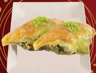
$8.99 85 Sobyet Baklava (2 pcs)