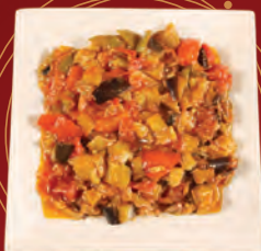
011-Eggplant Salad $9.99 Eggplant, Green Pepper, Red Pepper, Tomato & Garlic.