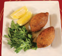
014-Idli Kofte 2pcs $9.99 Bulgur, Ground Beef, Onion, Tomato Paste, Parsley & Lemon.