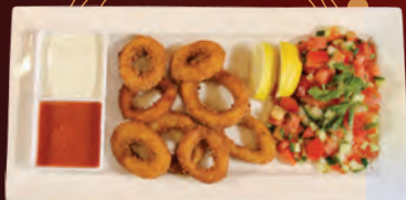
016-Calamari 8 Pcs $16.99 Calamari, Garlic Sauce, Hot Sauce & Salad.