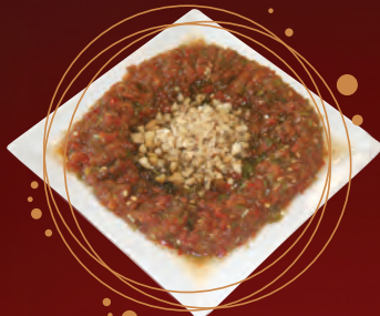
008-Ezme - Spicy Mashed Salad $9.99 Spicy mashed tomatoes & peppers mixed with tomato paste, paprika