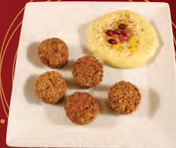
015-Falafel 5 Pcs. $9.99 Chickpeas, Tahini, Garlic, Parsley, Salt & Seasonings