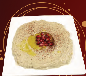
010-Baba Ghanoush $9.99 Char-grilled smoked eggplant puree flavored with garlic, olive oil and lemon