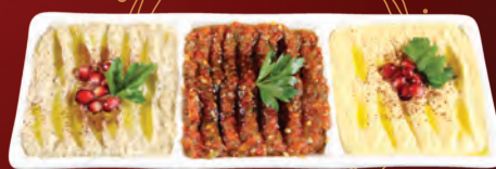
018-Mix Appetizer Plate 3 $17.99 Humus – Ezme – Baba Ganoush