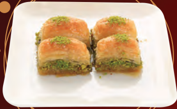
$8.99 79 Baklava (4pcs)