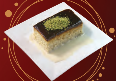
$8.99 87 Trilece/ tres leches