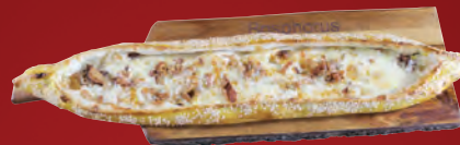
024-Chicken Doner & Cheese Pide $18.99 Topped with chicken shawarma and mozzarella cheese.