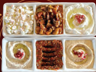
019- Mix Appetizer Plate 6 $27.99 (Humus -Ezme – Baba Ganoush – Cacik -Eggplant Salad-American Salad)