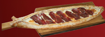
026-Pastirma cheese Pide $20.99 A thin crust topped with Turkish pastrami and mozzarella cheese.