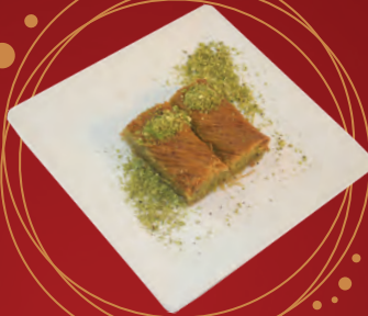
$8.99 83 Burma Kadayif (2 pcs)