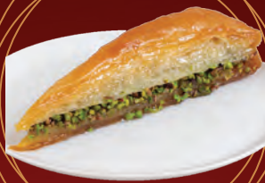
$7.99 80 Havuc Dilim (1 pc)