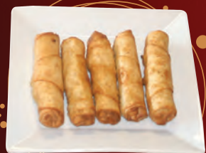
013-Sigara Borek $9.99 Spring roll with cheese & Parsley