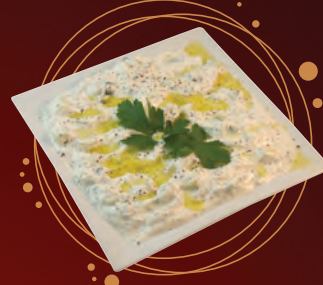
009-Cacik - Tzatziki $9.99 Finely chopped cucumbers blend with garlic yogurt & mint