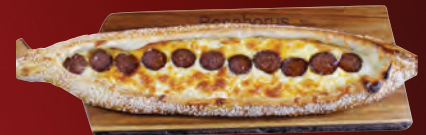
025-Soujouk Chese Pide $19.99 A thin crust topped with Turkish soujouk and mozzarella cheese.