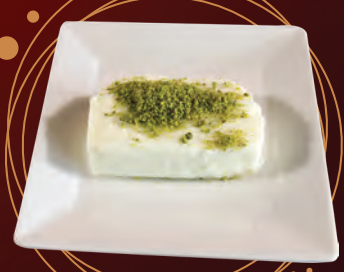
$5.99 90 Turkish ice cream