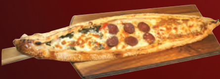
029-Mixed Pide With Cheese $20.99 Topped with diced beef, spinach, Soujouk & mozzarella cheese